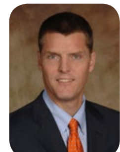
[Signature] Board Chair